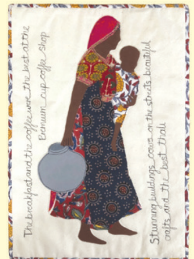
Right: 'Indian Sketchbook Series 3' by Gillian Travis